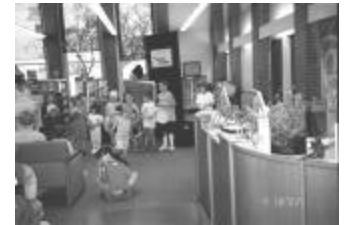
The Smudge Fundaes, a Library sponsored event entertains kids of all ages during last year's National Library Week.

Serving residents of the city and surrounding townships, the St. Clair branch has over 31,000 items, including large print and paperback books, magazines, books on CD and cassette tape, read-along book and cassette sets for children, music CDs, videos, DVDs, fishing poles, and hooked-on-phonics kits.