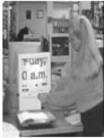
Color magnifier that enlarges print or pictures is located on the Main Floor of the Main Library.

Do you have difficulty reading this? Or do you know someone who can no longer read regular print? The Main Library has a color magnifier that enlarges type so that you or someone you know can read favorite books or newspapers. Bring your family photos to enlarge and view. It's free!