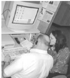
Adaptive Technology at the Main Library helps the Blind and Disabled enjoy the use of computers and the world online.

In addition, the Main Library has a computer that allows the print disabled (blind and low vision people) to access and read newspapers and books online and features speech software that reads the text to the person. The print on the computer is enlarged so a user can easily read email from friends, surf the Internet, play games, or browse the library's on-line catalog of materials available for check out. It's free and user friendly.