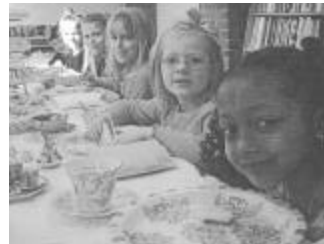
These kids are getting ready for a Tea Party program at the St. Clair Branch.

The branch has copy and fax machines, a laminator, seven public computers with Internet access, two computers for children, and an automated card catalog. A Kurzweil Reading Edge machine is available for the blind or impaired. Newspapers include the Times Herald, Detroit Free Press, USA Today, Wall Street Journal, Barron's, Value Line, and Morningstar.